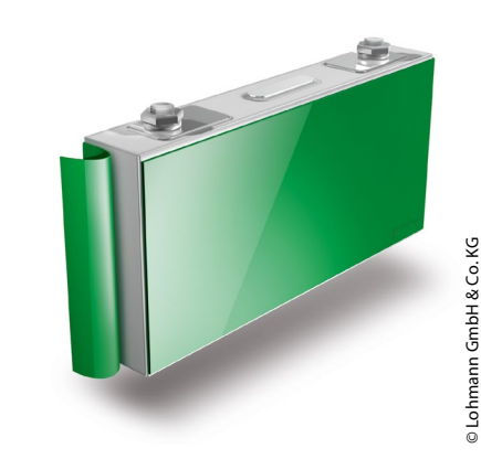
Figure 3 Single or double-sided adhesive PET films are ideal for the electrical insulation of sensitive battery components and provide effective protection against short circuits.

Electrically conductive, single-sided adhesive foams and tapes ensure that electronic devices function without problems throughout their entire service life ( Figure 3 ). The Duplo COLL EC (electrically conductive) adhesive tapes also have a metallized fabric or foam backing and an electrically conductive acrylic adhesive on one or both sides, together with a 50-µm