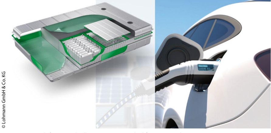
Figure 1 Multifunctional adhesive tapes are ideal for use in EV batteries.

To support these trends in the field of electric vehicle batteries and the increasing digitalization and miniaturization of systems, Lohmann supplies tailor-made adhesive solutions and high-precision diecuts (Figure 1). The range of multifunctional materials includes adhesive tape solutions that provide functions such as damping, sealing, electrical insulation and conductivity as well as efficient thermal management. These adhesive tapes play a crucial role in improving battery performance, extending battery life and ensuring that production processes are reliable and efficient. Lohmann focuses on developing an increasingly sustainable value chain that covers all the stages of production from adhesive manufacturing to in-house conversion. For example, the company's production processes uses only green electricity, the supply chain is as short as possible and located in Europe, and, depending on the customers' requirements, ranges of solvent-free adhesive tapes can be produced. In addition, Lohmann already calculates the complete