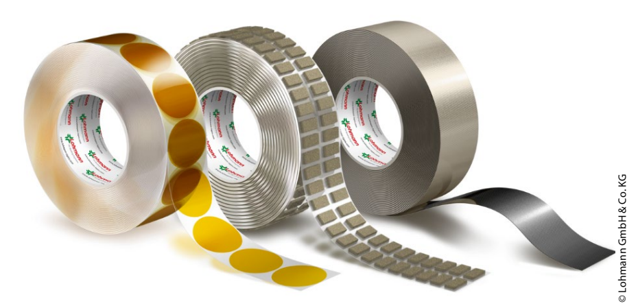
Figure 4 The tapes include electrically conductive solutions with metallized fabric or foam backings and electrically conductive acrylic adhesive and electrical insulation solutions, such as single-sided adhesive PET films in various thicknesses and colors.

transfer tape with an electrically conductive acrylic adhesive. These adhesive solutions are used for electrical connections with low currents, connecting conductive materials, EMI shielding and grounding. This eliminates the cost of additional connecting wires. The fabric adhesive tapes are available in isotropically and anisotropically conductive variants, while the foam adhesive tapes are isotropically conductive and tested in accordance with ASTM D 4935. The EC tapes with grounding and shielding properties against electromagnetic waves are ideal for use in electronic components. The combination of an electrically conductive backing material and an electrically conductive adhesive provides excellent shielding in the range from 450 MHz to 3.8 GHz (5G). This allows electronic components that are operated in close proximity to each other to be used safely. The electrically conductive foam tapes can easily be compressed and therefore compensate for the tolerances between components. At the same time, they provide a permanent grounding function with continuous contact.