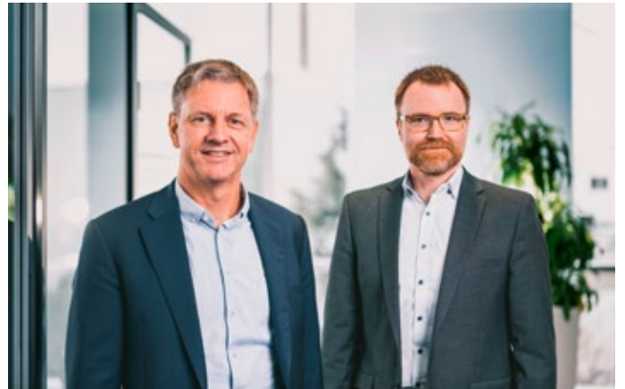
Lohmann Executive Board Neuwied, December 2024

For us, this guide is a code of conduct for all areas where cooperation is involved: with customers, suppliers and every individual inside and outside our organization. This is our standard, and the one by which we wish to measure ourselves.